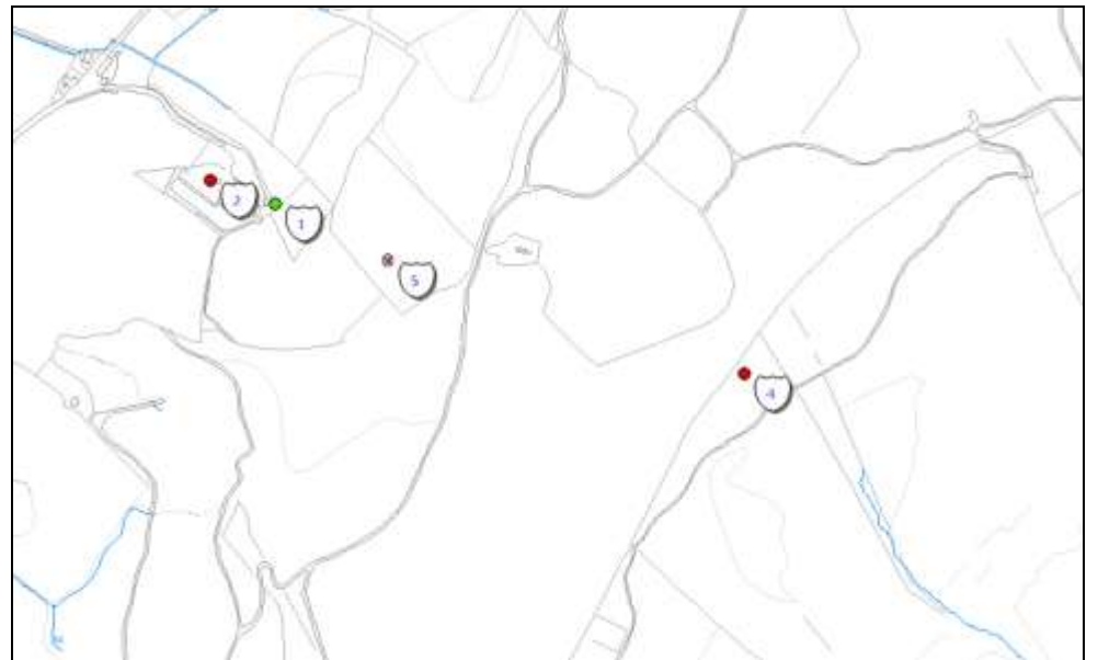
Extract from NIEA SMR MapViewer of the site (Map ID No. 4)