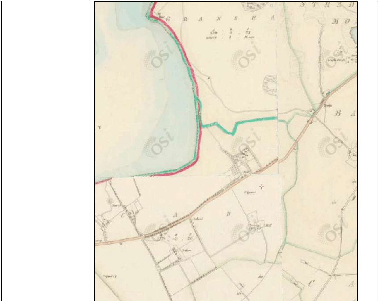
1st ed OS Map extract (1829-1842)