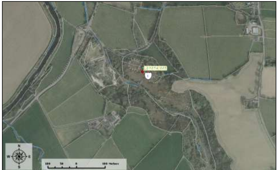
Extract from NIEA SMR MapViewer of the site (Map ID No. 1)