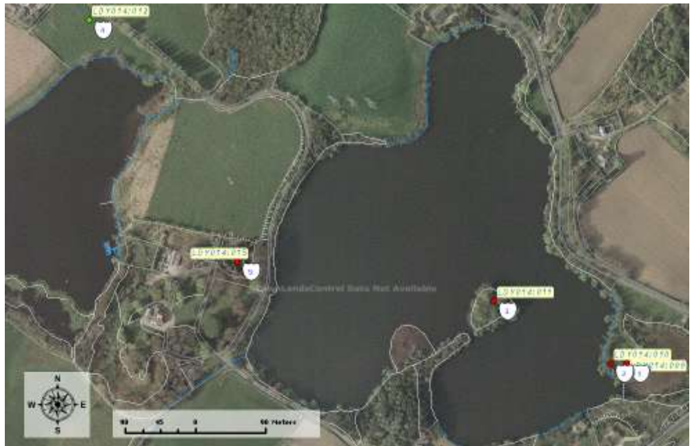
Extract from NIEA SMR MapViewer of the site (Map ID No. 1 & 2)