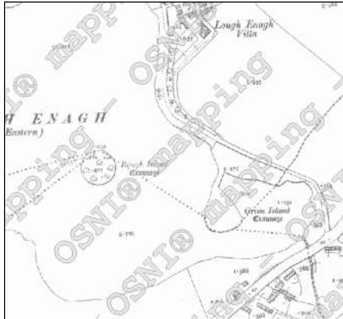
1 st edition 25-inch OS map extract 1873 – 1854