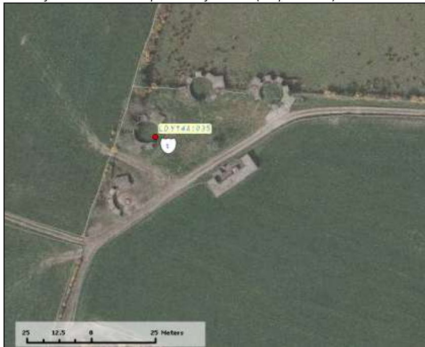
Extract from NIEA SMR MapViewer of the site