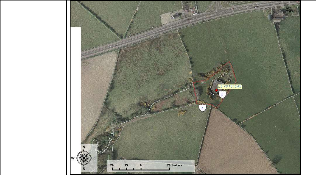
Extract from NIEA SMR MapViewer of the site (Map ID No. 1 & 2)